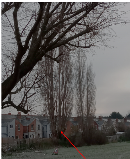
(officer photo - viewed from Gosbrook Road)